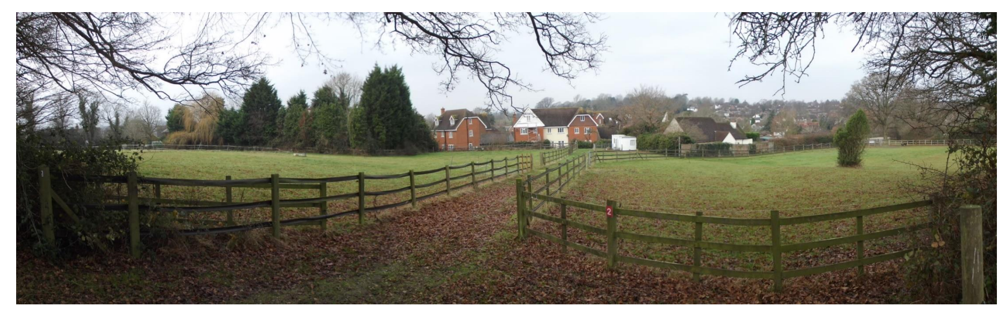
View across fields from the high ground behind central buildings